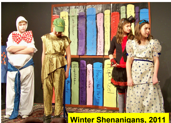
Winter Shenanigans, 2011

Johnson Hall will provide snacks, and campers must bring their own lunch each day. Parents are asked to bring snacks for the cast party after the show on Thursday, February 23.